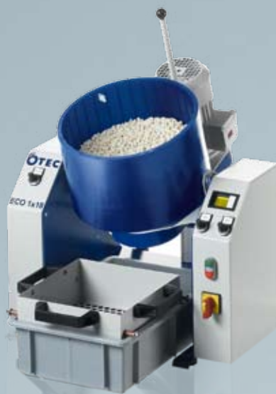
▲ ECO 9 | 18 The grinding center for larger production runs: The ECO 9 | 18 – the affordability of innovative technology.