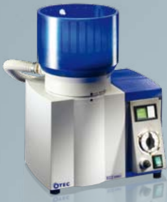
▲ ECO-Maxi The economical solution for small production runs: The ECO-Maxi, perfect, refined, and expandable.